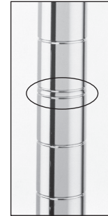
SiteSelect Posts feature double grooves every 8" (203mm) to aid assembly.