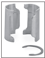
Aluminum Split Sleeve