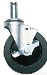
5MB Wheel Brake