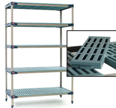
Five Tier Starter Unit