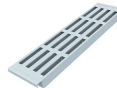
Open Grid Mat