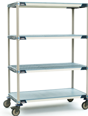
Open Grid Mat