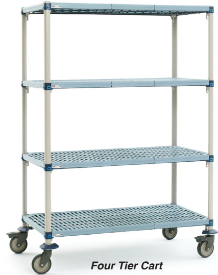
Four Tier Cart