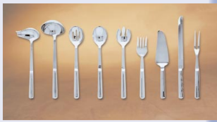
O. HOLLOW HANDLED BUFFET WARE: pictured left to right in the order listed.