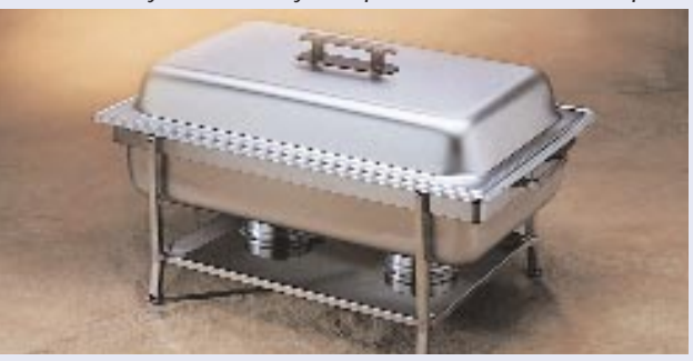
C. ECONOMY CONTINENTAL CHAFER

You'll receive years of worry-free performance at a value price.