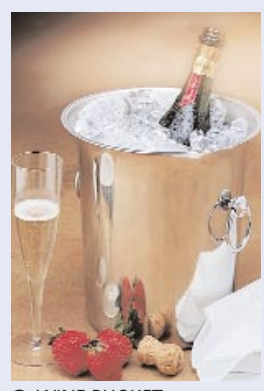
Q. WINE BUCKET