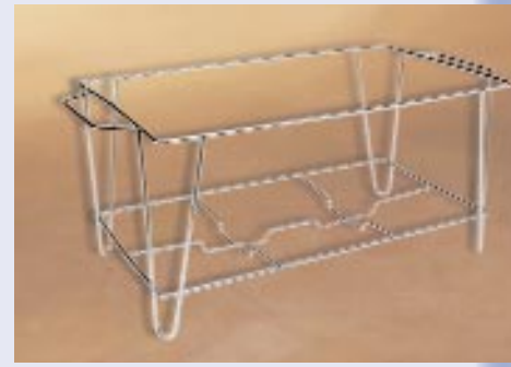
N. WIRE CHAFER FRAME