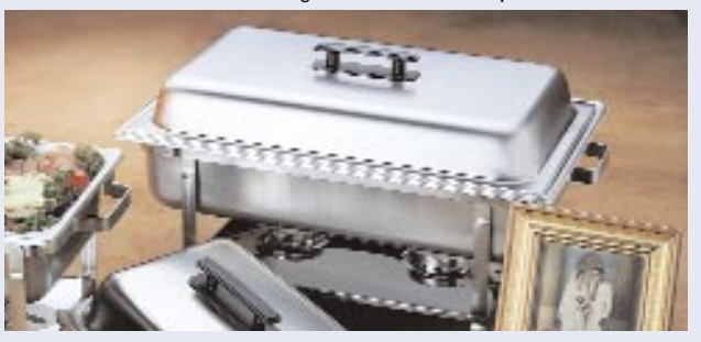
B. CONTINENTAL CHAFER

High quality, hard working reliability. That's why our Continental Chafer is a long time favorite of professionals.