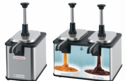
EZT-S & EZT short models

Models accommodate large and small operations, serving 1 or 2 toppings with or without the ability to pre-heat a reserve pouch; single unit also available without spout heater.