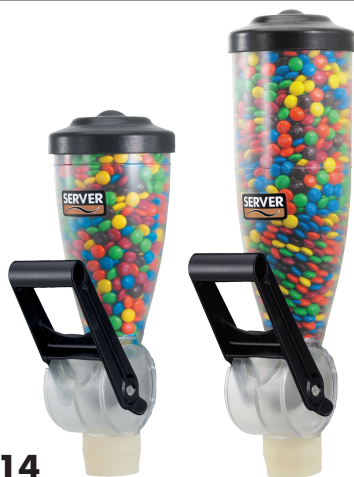
DPD 1L 87214 DPD 2L 87215