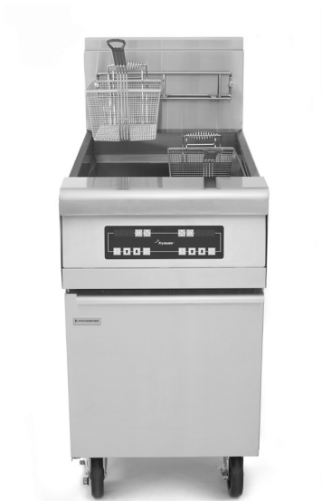
Shown with optional digital controller and casters