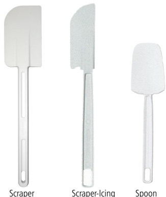
Scraper Scraper-Icing Spoon