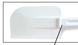
Clean-Rest™ reduces risk of cross-contamination.