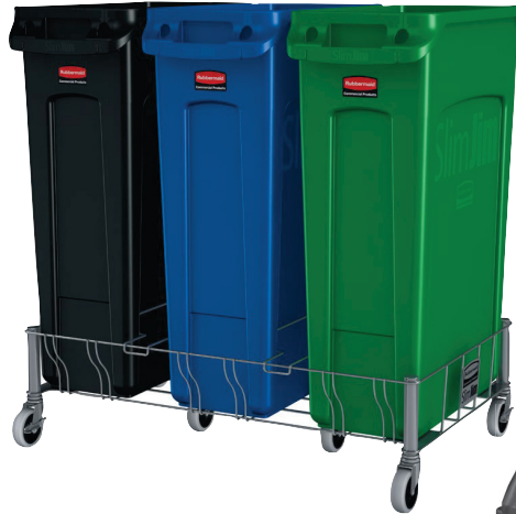
1956192 with FG354060 / 1956185 / 1956186