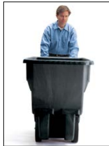
Inset wheel position prevents damage to surroundings.