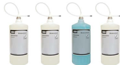
FG4013131 / FG4015431 FG402363 / FG402364 FG4013111 / FG4015411 FG4013121 / FG4015421