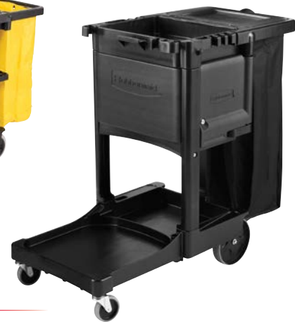
EXECUTIVE SERIES™ 1861430