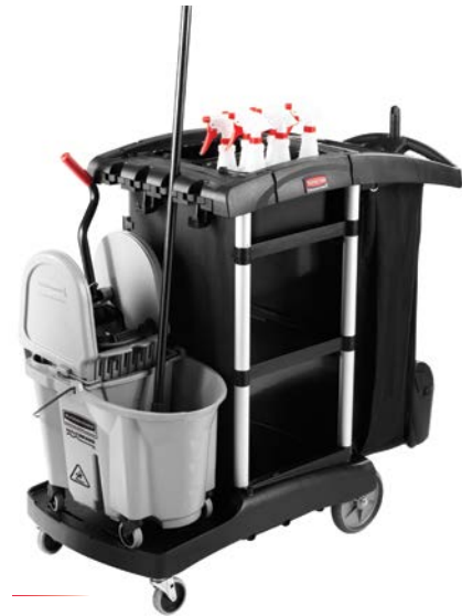
EXECUTIVE SERIES™ 1861429