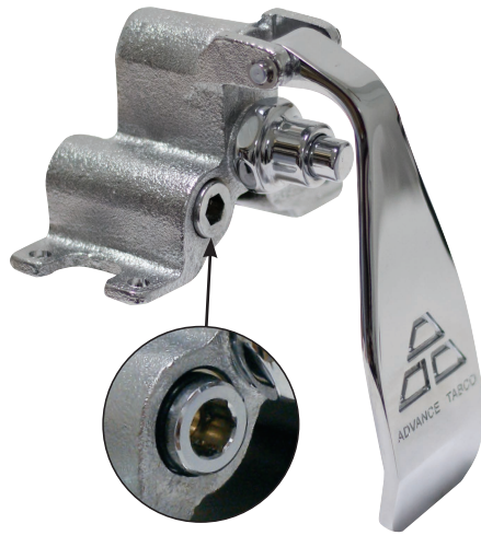
Adjustable Mixing Valve