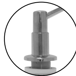
Hand pump soap dispensing activator