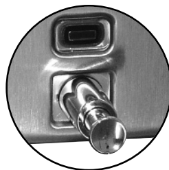
Push button soap dispensing activator