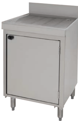
w/ Mid-Shelf & Door CRD-2BMD Shown