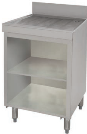
Open Base w/ Mid-Shelf CRD-2BM Shown