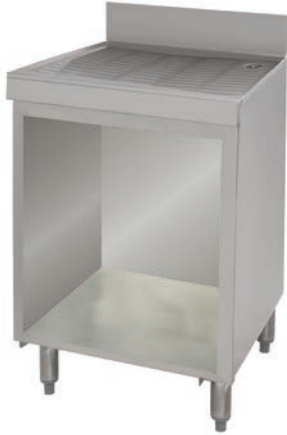
Open Base CRD-2B Shown