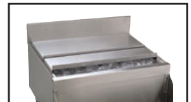
Optional Sliding Stainless Steel Cover Shown