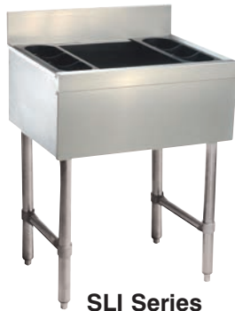
SLI Series 18" Wide Units