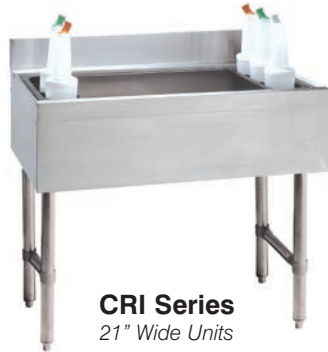
CRI Series 21" Wide Units