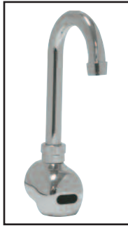
Splash Mount K-175 (Shown)