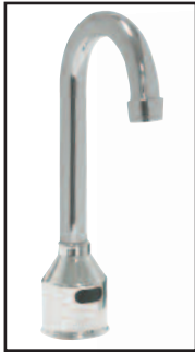
Deck Mount K-180