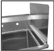
K-700 Removable Side Splashes Fits Left OR Right Side