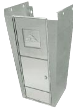
Add Trash Receptacle For 7-PS-33, 7-PS-37 or 7-PS-37B Only 7-PS-29

*Pedestal Base For 7-PS-20 and 7-PS-20-NF Hand Sinks 7-PS-37B