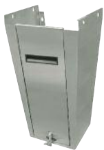
With Foot Valve 7-PS-33