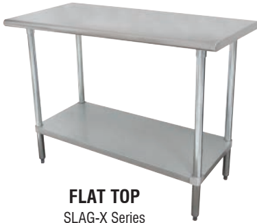
FLAT TOP SLAG-X Series

LEGS: 1 5/8" diameter tubular stainless steel. Stainless steel gussets. 1" adjustable stainless steel bullet feet.