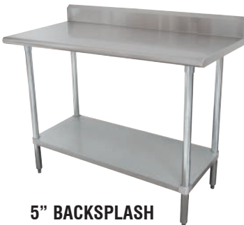
5" BACKSPASH KSLAG-X Series