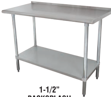
1-1/2" BACKSPASH SFLAG-X Series