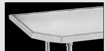
TA-75 Mitered Edge