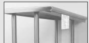
TA-77 Check Minder Shelf Provision