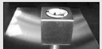
TA-112 Hubble Outlet