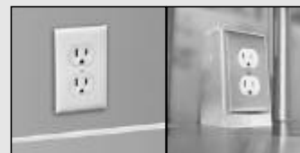
Duplex Electrical Outlets TA-62 TA-62A TA-62B TA-62C