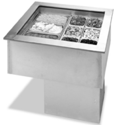
Model: Drop-In Cold Well