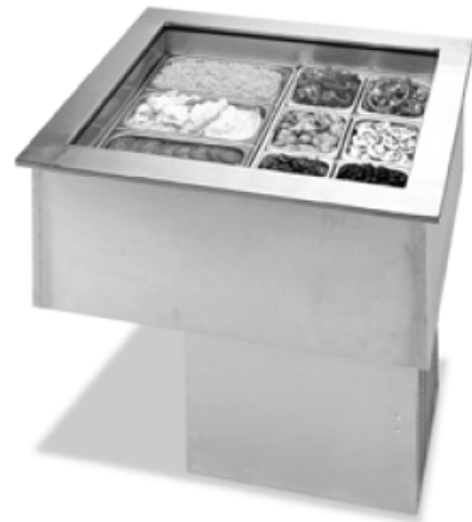
Model: Drop-In Cold Well