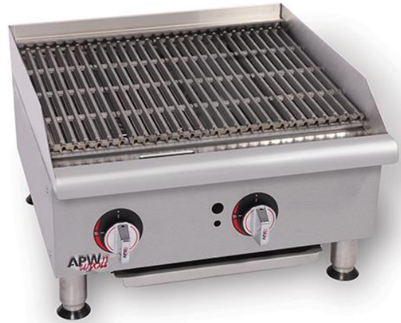
Model GCRB-24i Gas CharRock CharBroiler