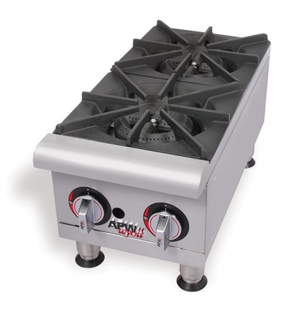
Model GHP-2i Standard Gas Hot Plate