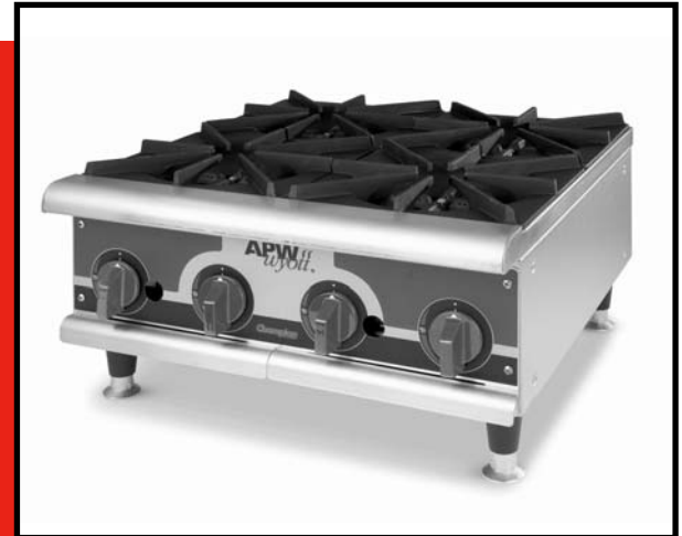
Model GHP-4H Standard Gas Hot Plate