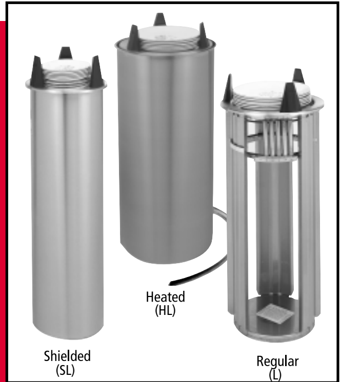
Lowerator® Drop-In Dish Dispensers