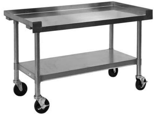
Medium Duty Cookline Stand