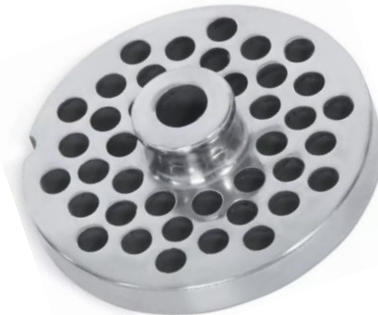
2 Plates Included (6mm & 8mm) Additional Accessories Available Upon Request

** Due to continuous product improvement, specifications are subject to change without notice.