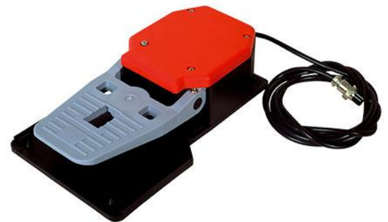
Optional Accessory: On / Off foot control pedal

** Due to continuous product improvement, specifications are subject to change without notice.