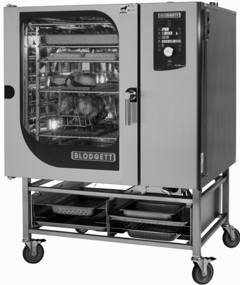
Shown on optional stand with casters

Single Electric Boilerless Combination-Oven/Steamer