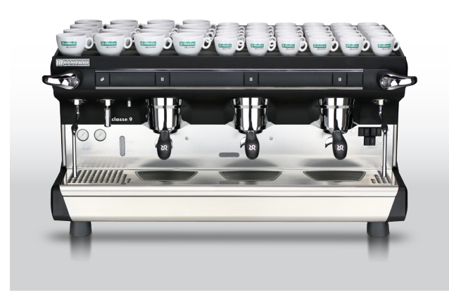
Classe 95 - 3 groups