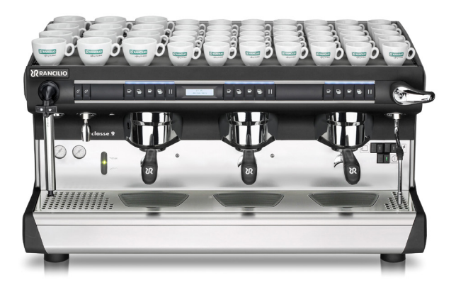
Shown with Optional iSteam