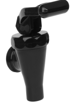
FAUCET ASSY, BLACK NUDGER