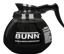
DECANTER, GLASS-BLK 12C 24/CS