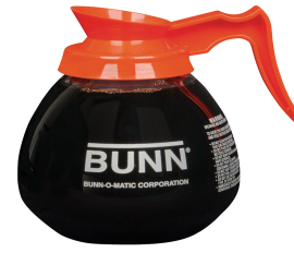
DECANTER, GLASS-ORN 12C 3/CS