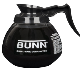
DECANTER, GLASS-BLK 12C 3/CS