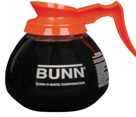
DECANTER, GLASS-ORN 12 CUP 1PK