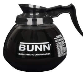
DECANTER, GLASS-BLK 12C 24/CS