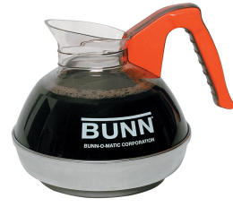
EASY POUR®,(ORN) 6/CS