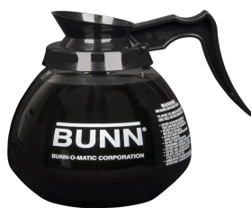
DECANTER, GLASS-BLK 12CUP 1PK