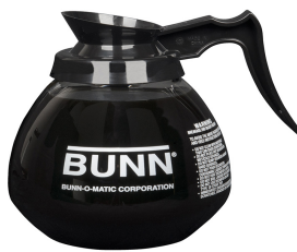
DECANTER, GLASS-BLK 12C 3/CS