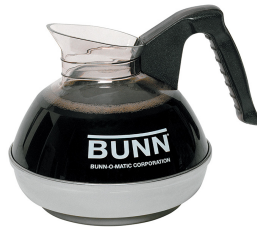
EASY POUR®,(BLK) 3/CS