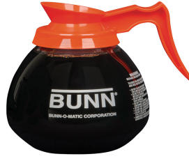
DECANTER, GLASS-ORN 12C 24/CS