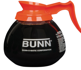
DECANTER, GLASS-ORN 12C 3/CS