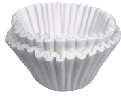
FILTERS,U3 18x7 252CS 252/1 36/CL