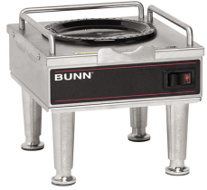
RWS1, 120V-SATIN NKL LEGS