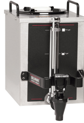
1.5GPR-FF, TOP HNDL