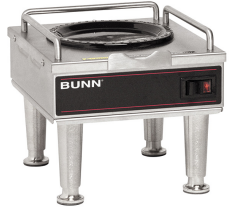
RWS1, 120V-SATIN NKL LEGS