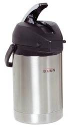
AIRPOT, 2.2L SST LA SINGLE PK