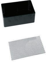
DRIP TRAY KIT, 2.25"HT OHW