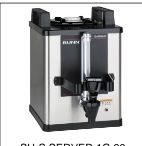
SH-S SERVER 1G 60 MIN ADJ TMR