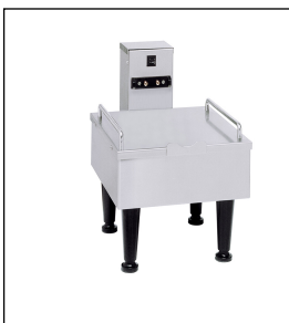
1SH STAND, 120V