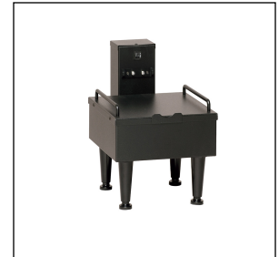
1SH STAND,120V BLK