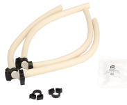
TUBE KIT, .188 PUMP LCC/LCA