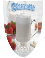
DISPLAY, GRAPHICS STEAMERS