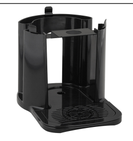
STAND ASSY, TF SERVER