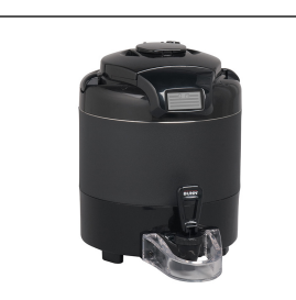
TF SERVER, DSG2 1G BLK NOBASE