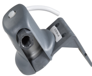
WATER FILTER HEAD, EQHP-VHD