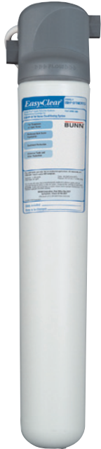
Model EQHP-SFTN Water Quality System