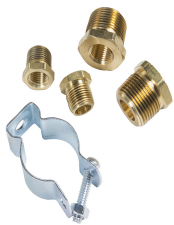
INSTALLATION KIT, SCALE-PRO